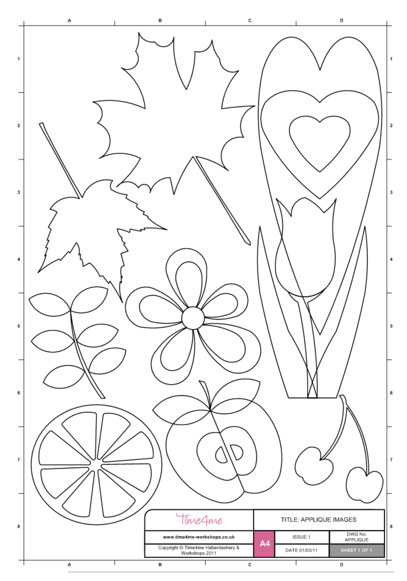
Copyright © 2010 Time4me Haberdashery & Workshops